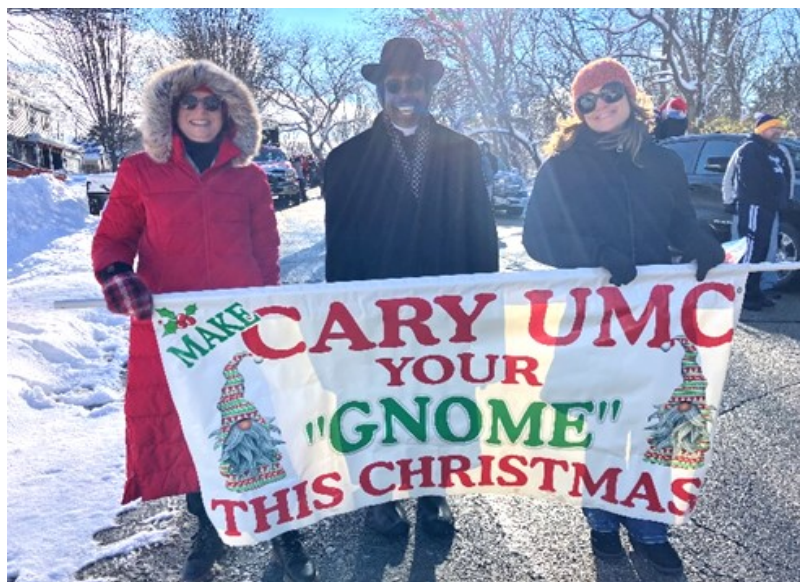
Pictured in photo: